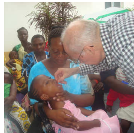
Giving oral polio vaccine at launching of campaign Malindi district.