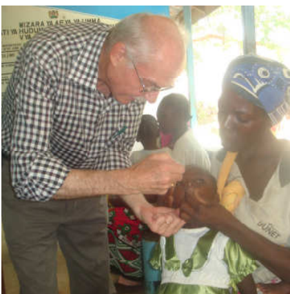
Polio campaign launch at Rabia, Kenya