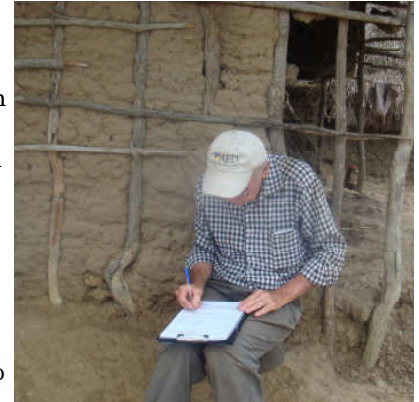
Consultant monitoring vaccinated areas.

This past year I worked as the Senior Polio Consultant with Bill and Melinda Gates Foundation for high level advocacy in routine vaccination, surveillance and cross-border activities, as well as supervision and monitoring of immunization campaigns in Kenya and Uganda. I was able to provide expertise for the Ministry of Health and Immunization Partners during the period of re-infection of the Polio virus in Kenya in 2013. The major aim was advocacy at the higher levels of government, to increase commitment to have their population, especially under fives, vaccinated. Polio was a disease burden almost 14 years prior to reintroduction in Kenya so the government had to make a renewed commitment which required advocacy by the partners and Ministry of Health. Finally, and most recently, I have been working with the Sabin Vaccine Institute to sensitize the Federal Minister of Health, Ministry of Finance and Economic Development, Health Committees of the Parliament, WHO, and UNICEF to promote a Sustainable Immunization Financing Program in Ethiopia. This program aims at facilitating discussions to create innovative mechanisms by key players and decision makers to increase domestic funding for immunization in light of increased cost of vaccines and the reduced external funding.