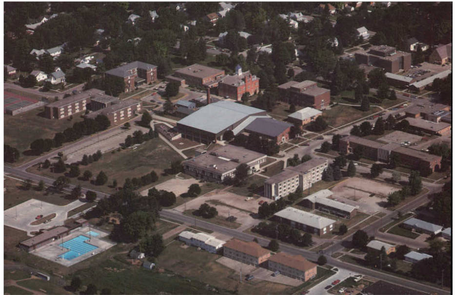
Westmar campus postcard picture taken in 1990.

The Le Mars Daily Sentinel published a series of stories on the tenth anniversary of the closing. They can be read at the Sentinel's website ( www.lemarssentinel.com ).