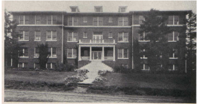
Wernli Hall—West View (taken from the 1924 Pilot yearbook)

There were three floors of residence rooms with two open staircases from top to bottom. This made it possible to call to the