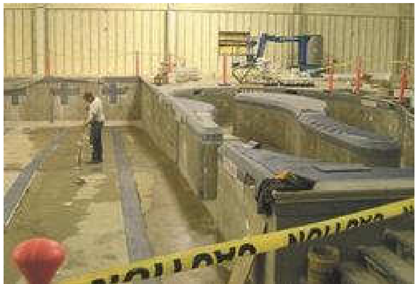
The transformation from old gymnasium to Indoor Aquatic Center is nearing completion. With tile laid in the pool and current channel, workers will next begin plastering the pool and will install the play equipment when it arrives.

KLEM Radio in Le Mars reported on February 6, that the pool ought to be open by the end of Feb-